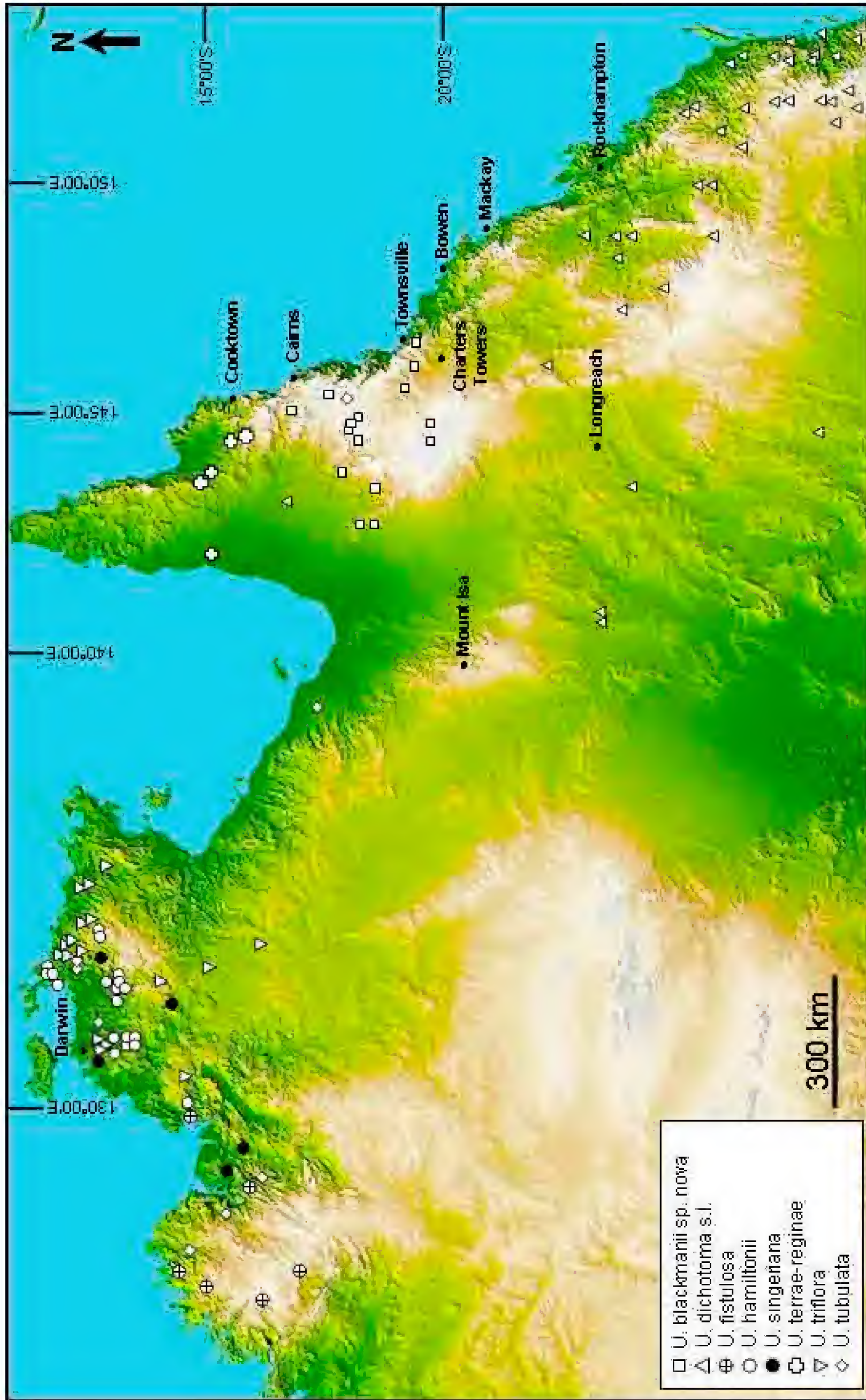
Fig. 2. Northern Australia showing the known distribution of Utricularia blackmanii (□), with closely related taxa (refer to key) and part of the Qld distribution of U. dichotoma indicated by triangles. Elevation is indicated by shading [from darker (green) of 1–100 m to white at ~1000 m];